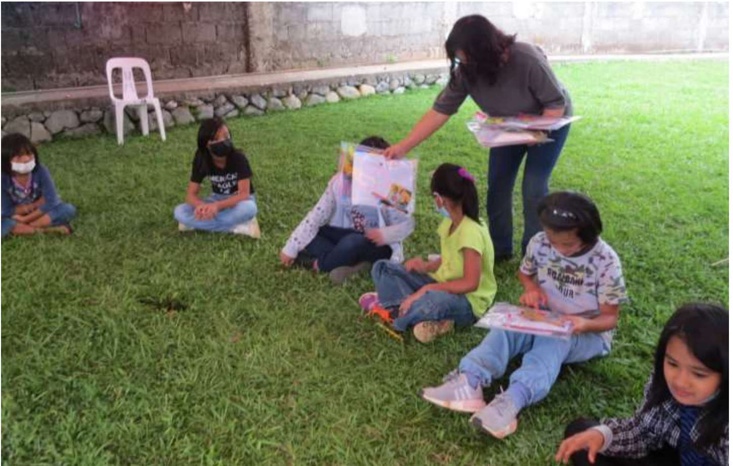
Distribution of school supplies to the students while they are in station 4.

OUR MISSION Deliver quality education through holistic, accessible and inclusive learning (HAIL) experiences to build socially and environmentally responsible global citizens and leaders.